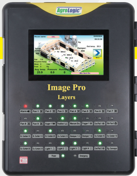
Image Pro Layers

The all-in-one Image Pro Layers is the most flexible and robust controller for poultry raising. Smart and easy-to-use, it's designed to handle all your housing needs for the long haul.